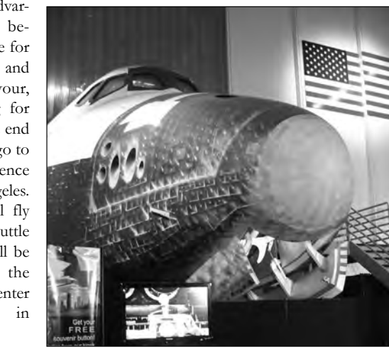
This mock-up located at Space Center Houston will be as close as many people from "Space City" or the heartland of America ever get to seeing a space shuttle orbiter following NASA's decision to place retired orbiters only on the east and west coasts.

To learn more about this important Texas industry, visit www.txchemcouncil.org .