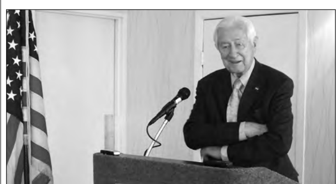
At the invitation of Rep. Pete Olson (TX-22), Rep. Ralph Hall (TX-4), the chairman of the House Committee on Science and Technology, visited Johnson Space Center and the local aerospace community in March. As chairman, Hall has oversight over NASA. While he was in town, the Bay Area Houston Economic Partnership's Aerospace Advisory Committee hosted a luncheon for Hall at the Nassau Bay Hilton where he spoke about his strong commitment to NASA.

According to the Texas Commission on Environmental Quality, Nitrogen Oxides, a main precursor to ozone formation, decreased almost 58 percent in Texas from 2000 to 2009. From 2000 to 2009, ozone levels in Texas have decreased by 27 percent statewide, more than any other state in the nation. By comparison, the rest of the nation averaged only a 12 percent decrease in ozone levels over this same time period.