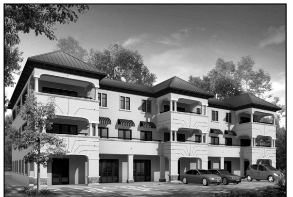
Artist rendering of The Design Center in Friendswood

The City offers continuous assistance to business owners to help them expand or relocate their businesses to the city through a variety of economic development incentives, such as property tax abatement, municipal grant incentives and tax increment financing.