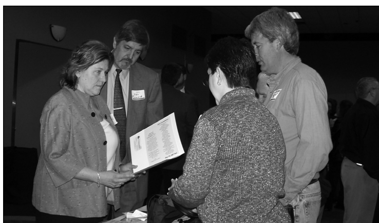
Potential vendors and representatives from Bay Area Houston school districts were given the opportunity to begin building working relationships during the 2008 Public School Vendor Breakfast that was held at NASA Johnson Space Center's Gilruth Center.

NASA's Gilruth Center is located on Space Center Boulevard, Gate 5, Building 207. The Vendor Breakfast will be held in the Alamo Ballroom.