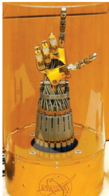
NASA robotic hand prototype on display at the Pumps & Pipes conference. NASA’s work in robotics offers possibilities for advancement in other major industries.